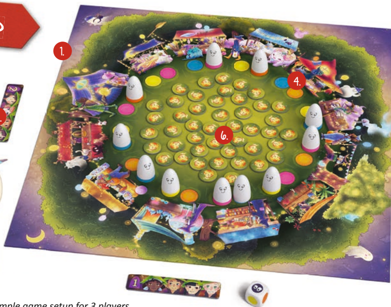
Example game setup for 3 players